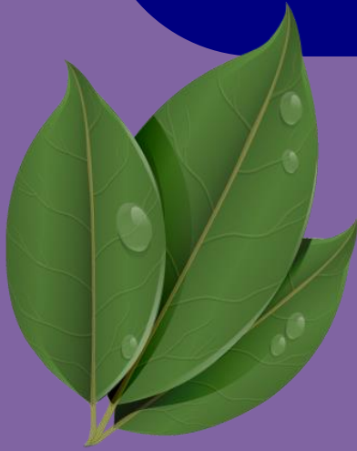
IMAGE: Three green leaves are connected at the stem. This represents multiple people working together toward a universal goal. The leaves have water droplets on them representing a fresh and healthy future.